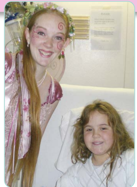
Volunteer Faeries from the A Faery Hunt non-profit organization brighten children's days in Northridge Hospital's PICU and Pediatrics Units.

The young girl received expert care in the child-friendly atmosphere that provides critical inpatient services for infants, children and adolescents through age 17. Today, she can speak again, her prognosis is good and she's not expected to suffer any future complications resulting from her accident.